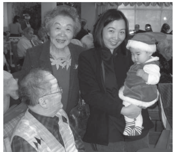
The Hamade Family at the Family Respite Centre's annual Holiday Party